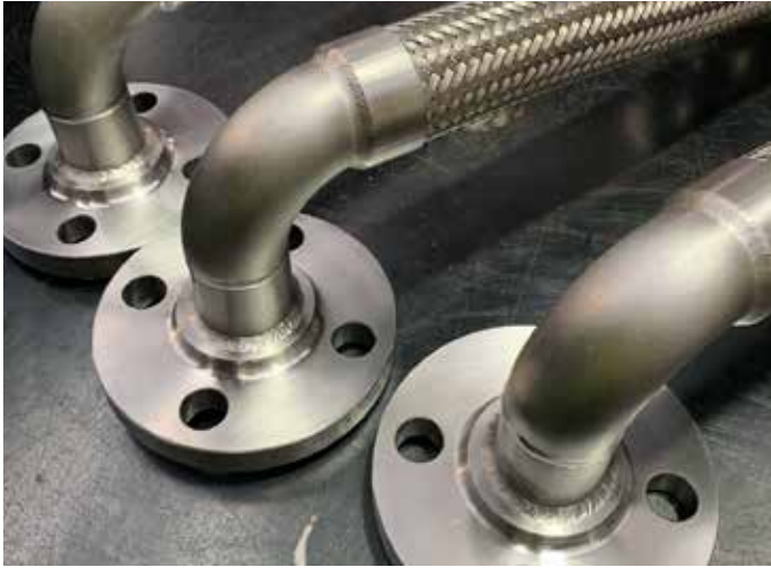
Custom Stainless Steel Hose Assemblies