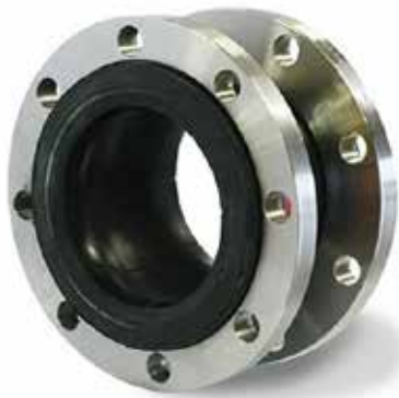
Rubber Expansion Bellows