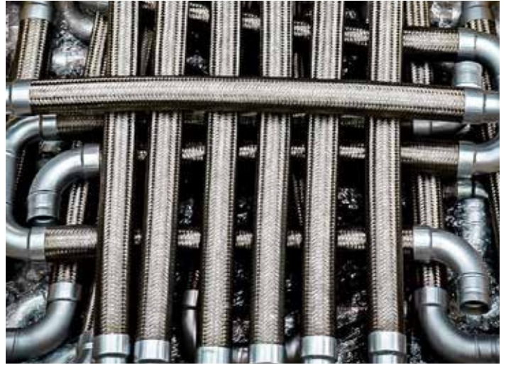
Seismic Joints Built To Earthquake Specifications